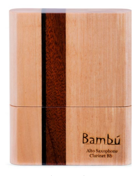
04 - LENGA / WALNUT / CANCHARANA