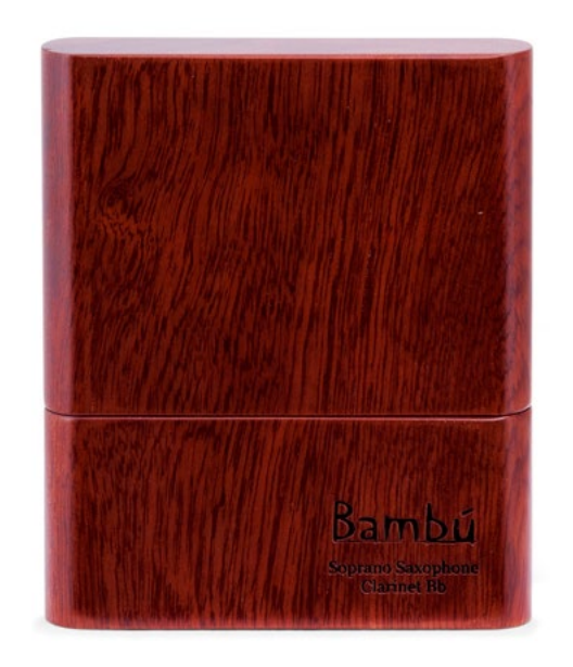
Bambú Soprano Saxophone Clarinet Bb