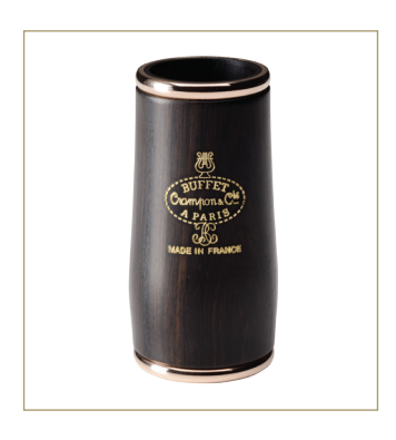
Gold finish ring