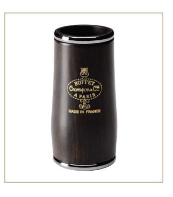
Black nickel finish ring